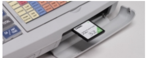
• CF card interface for fast, simple data transfer