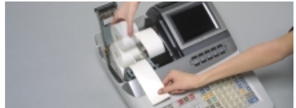
• Drop-in paper-loading for quick, easy paper roll changes