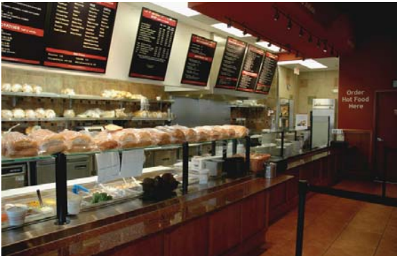
Cafeterias / Quick Service Restaurants