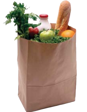
Convenience Stores / Small Grocery Stores