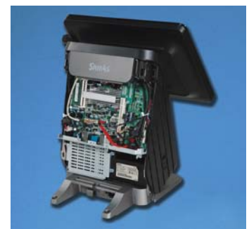
Tool-Free Entry to Access RAM and Hard Disk Drive Simplifies Serviceability