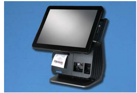
Card Reader / Printer / Scanner + Fingerprint Reader