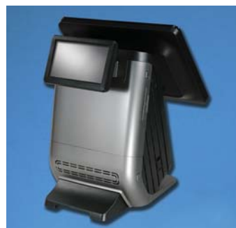
Optional Integrated 7" LCD Customer Display