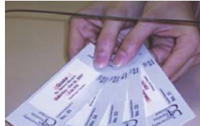
Theater Concessions / Ticket Booths / Box Offices