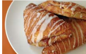
Dusty Environments Like Pizza and Bakeries