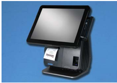
Card Reader / Printer / Fingerprint Reader