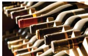
Tobacco Stores / Bars / Liquor Stores