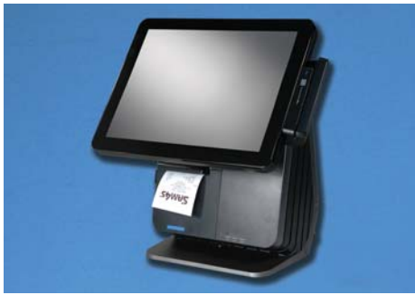
Card Reader / Printer