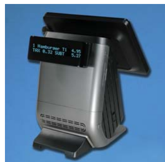
Optional Integrated VFD Customer Display